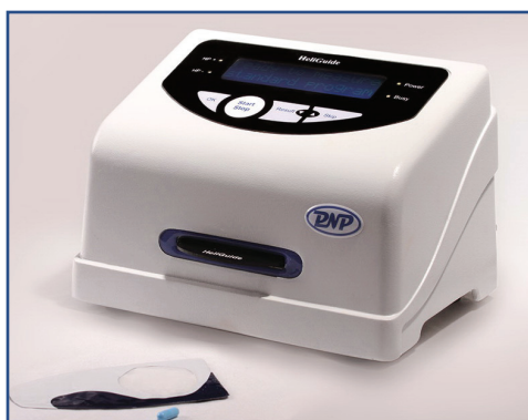
Figure 1. The HeliGuide system.

The HeliGuide analyzer consists of two shielded Geiger-Muller counters mounted face-to-face. An opening in the shield allows the insertion of the breath-card between the two counters. When the breath-card is fully inserted, its two pads are perfectly lined up with the two counters. The correct positioning of the breath-card is verified with an optical sensor. The analysis sequence can only be initiated if the card is properly inserted.